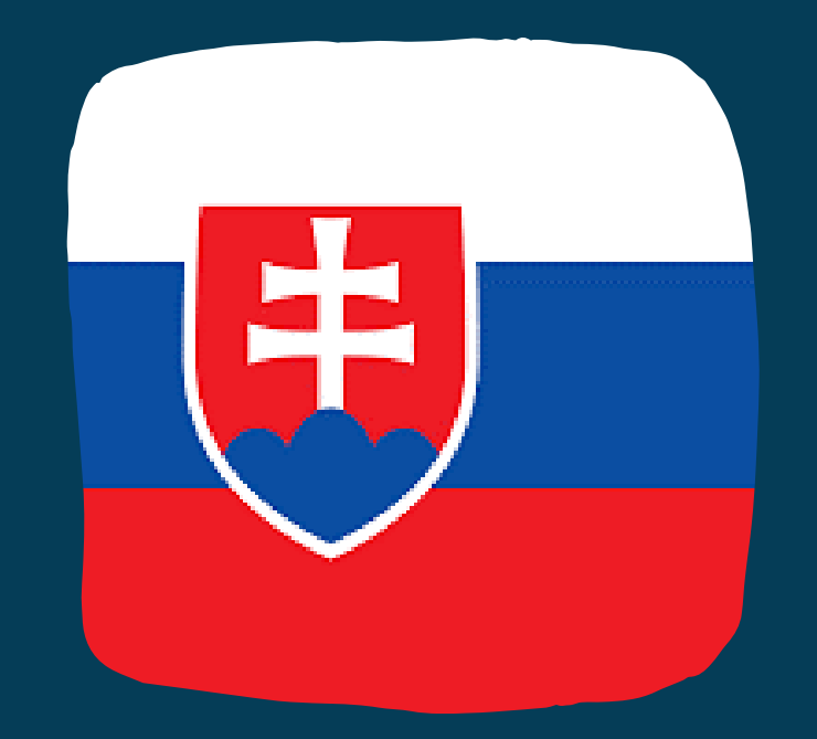
Youth for Equality