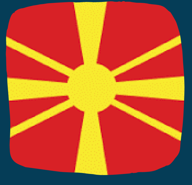
Здружение ЕКО-ЖИВОТ Кавадарци