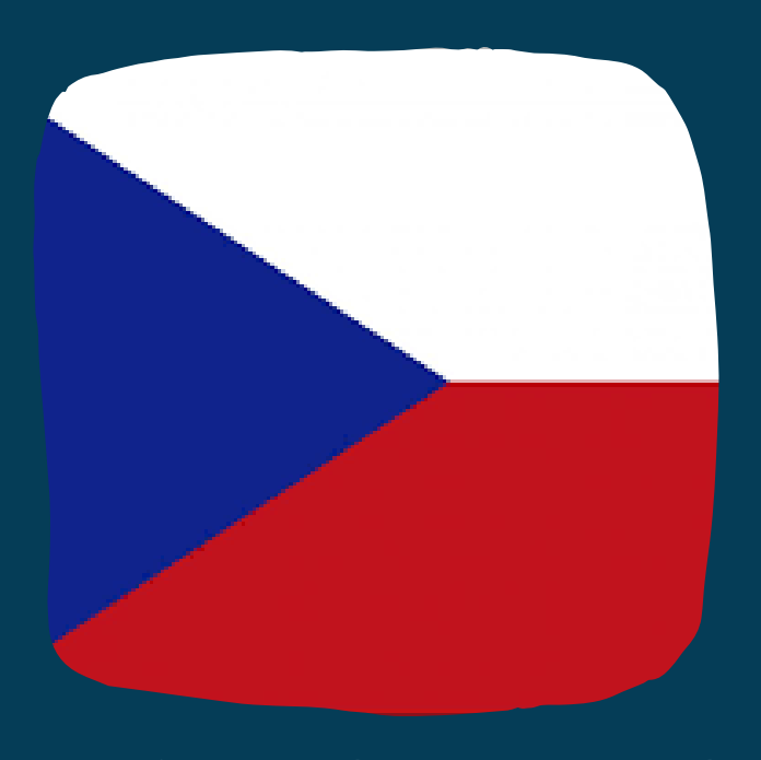
Asociace TOM DUMANCI