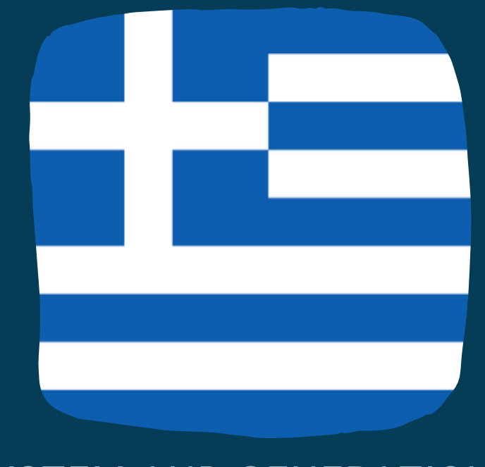
SYSTEM AND GENERATION ASSOCIATION